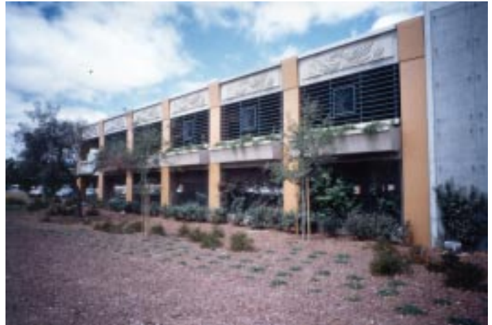
Stanford University Parking Structure V

In all three projects, the structural and architectural design takes advantage of the newly developed precast concrete hybrid moment resistant framing system. The PHMRF provides all of the lateral load resistance for the parking structures and is used in tandem with a cast-in-place concrete core for the office building. In addition to serving as the lateral load resisting structural system, the precast hybrid frame members are also exposed architecturally as the exterior skin for each building.