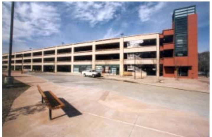
Stanford Shopping Center: Parking Structure