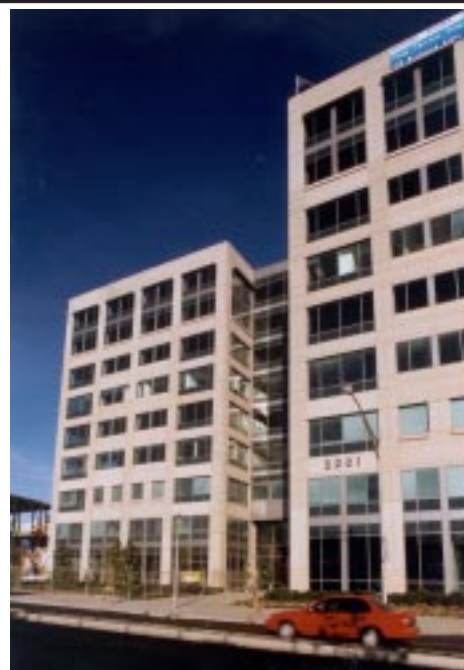
Pacific Plaza Office Building, Daly City