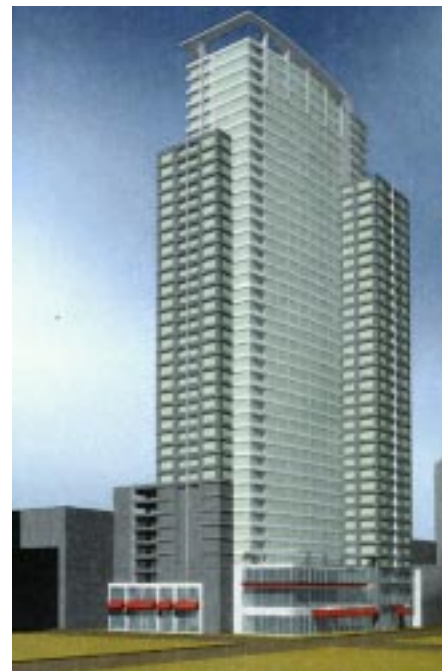
680 Mission Street

When completed in late 2001, the 39 story 680 Mission Street apartment building will be the tallest concrete structure erected on the West Coast in a high seismic zone. The building, standing 425 feet tall, will contain two floors of retail, one floor of commercial office space and 36 stories of apartments. The building's structural and architectural design takes advantage of the newly developed precast concrete hybrid moment resistant framing system. The frame provides all of the seismic resistance of the building from the eighth floor up, with a combination frame and shear wall system below the eighth floor. Besides serving as the structural system of the building, the precast framing members are also exposed architecturally as the facade of the building. Charles Pankow Builders, Ltd. is the Design-Builder of the project, Robert Englekirk Structural