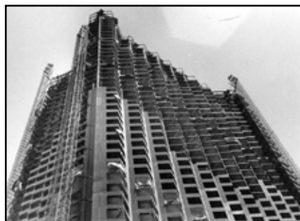
Bank of America Building, 555 California, during construction in 1968

each of two years at the University of California, Berkeley. He chose Civil Engineering as his major, which required an extra year of school as he lacked some of the lower division courses necessary for the junior year. He graduated on May 24, 1941 with a Bachelor of Science degree in Civil Engineering.