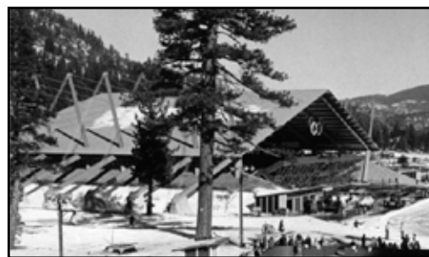
Blythe Olympic Sports Arena at Squaw Valley in 1959

His accomplishments were many, including being the primary structural engineer for earthquake design on the iconic 52-story Bank of America Building (555 California Street) in San Francisco, the tallest building in California upon completion in 1969 and currently still the largest by floor area in San Francisco. He was also the design engineer of an award winning design for the Squaw Valley ice rink, the Blythe Sports Arena with its cable-supported roof, for the 1960 Winter Olympics. The location of the current SEAONC office, 575 Market Street, is also a building designed by Charles.